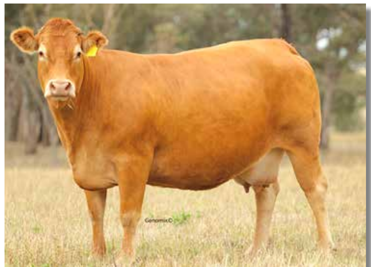
Le Martres Celest LEMPC55