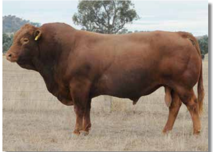
Le Martres Hambleton (H59) - Aust. Pure & Polled