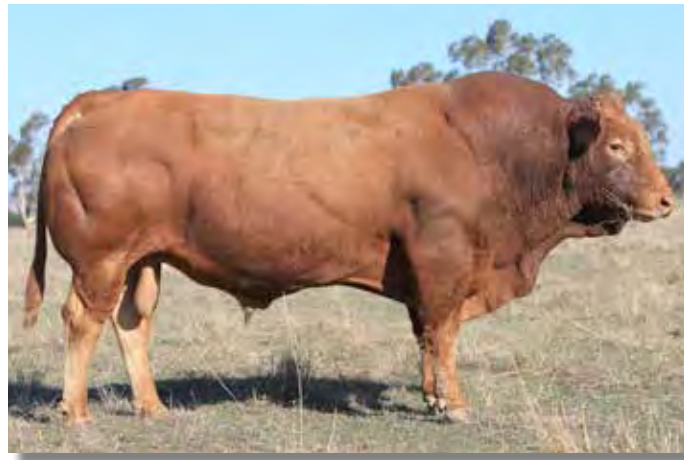
Le Martres Eleazor (E57) - French Pure