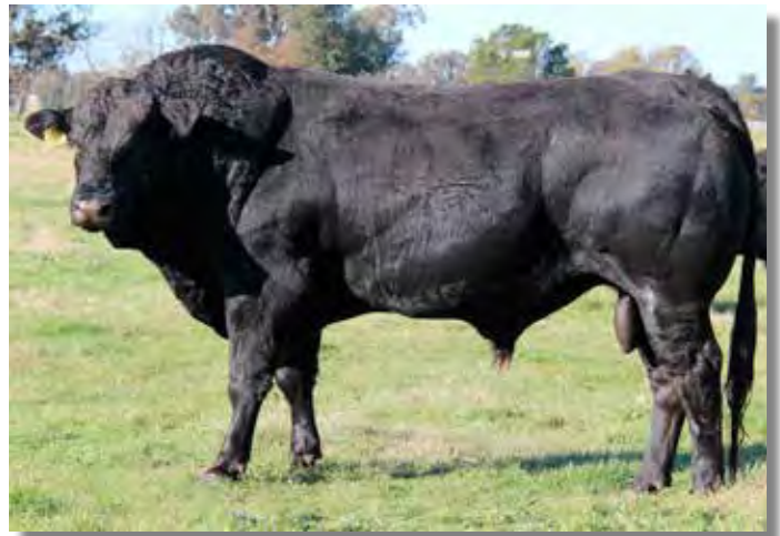
Le Martres Black Declan (D41) - Aust. Pure, Black & Polled