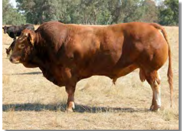
Le Martres Edwin (E42) - Aust. Pure & Polled