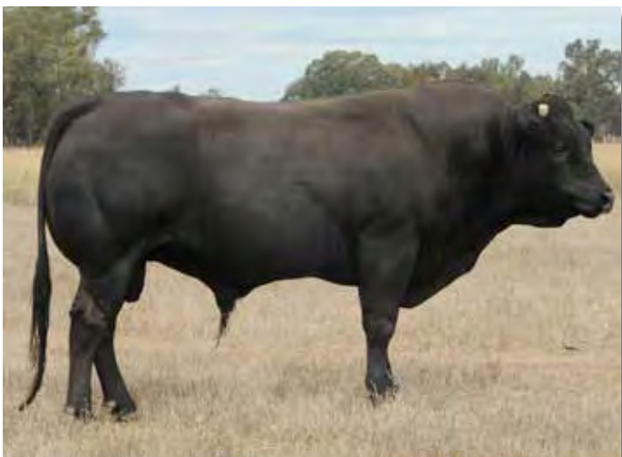
Le Martres Black Jacob (J72) - Aust. Pure & Scurred