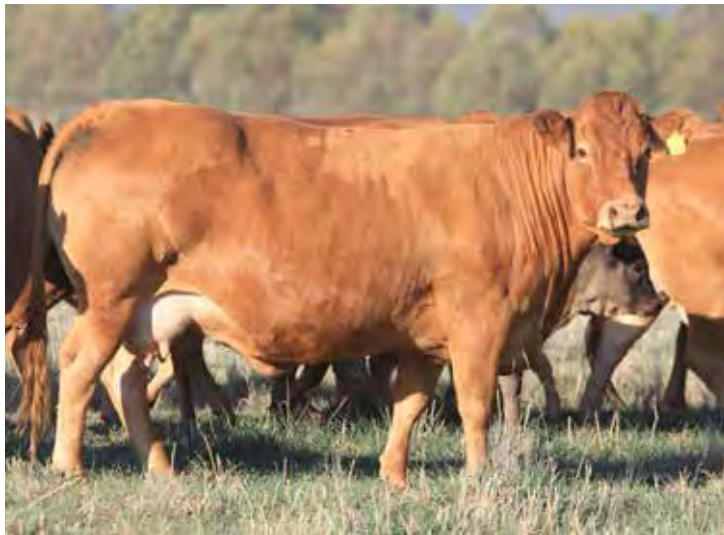
Le Martres Zille LEMFZ43