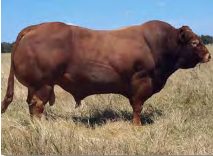
Le Martres Governor (G70) - Aust. Pure & Polled