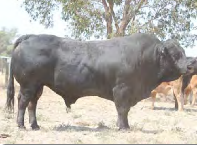
Le Martres Black Edbert (E24) - Aust. Pure, Black & Polled