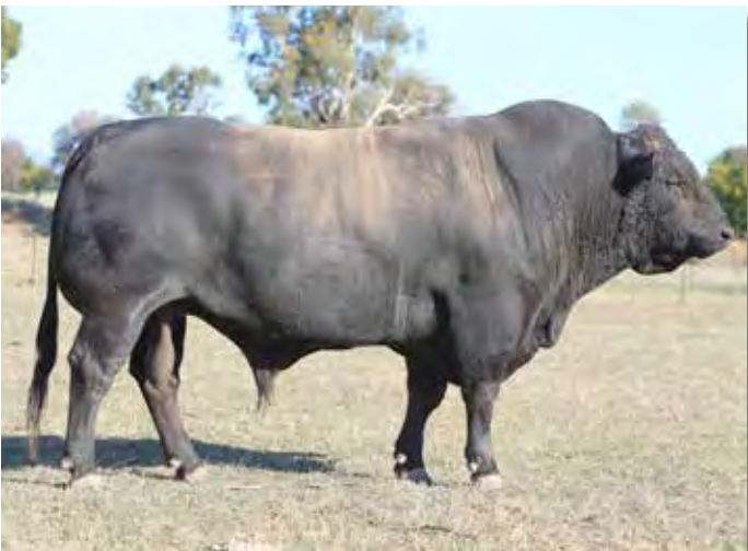
Limoges El Bulli (E16) - Aust. Pure, Black & Polled