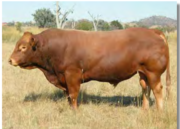
Limoges Esument (E22) - Aust. Pure & Polled