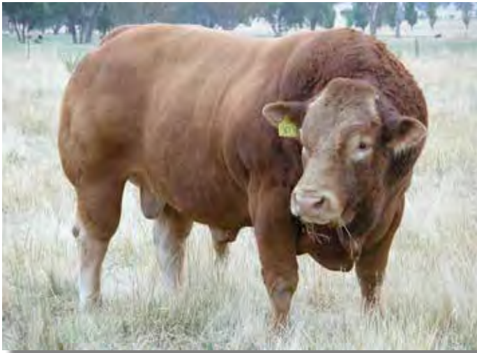
Le Martres Chad (C90) - French Pure