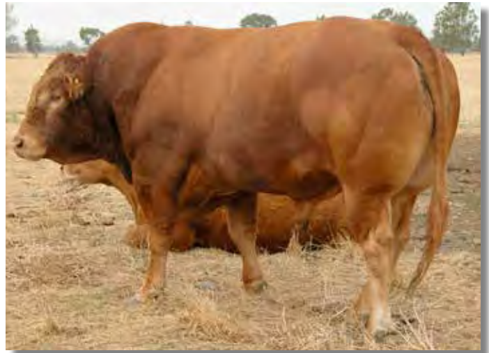
Le Martres Darby (D58) - French Pure