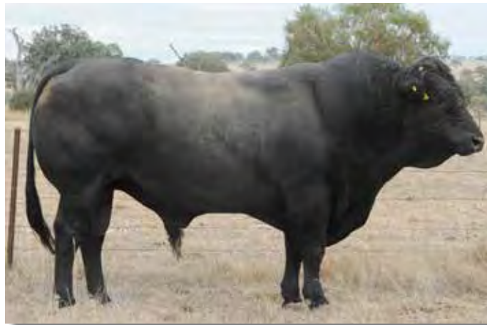
Le Martres Black Herald (H87) - Aust. Pure & Scurred