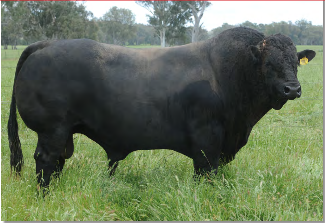
Stud Sire - Le Martres Black Herald H87