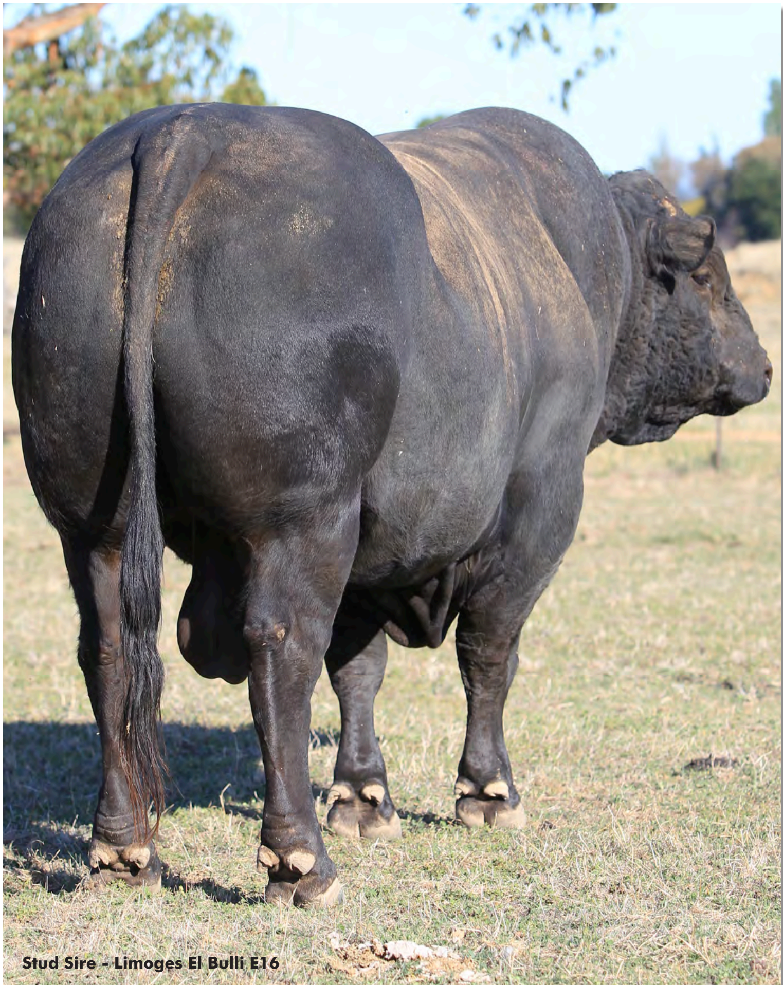
Stud Sire - Limoges El Bulli E16