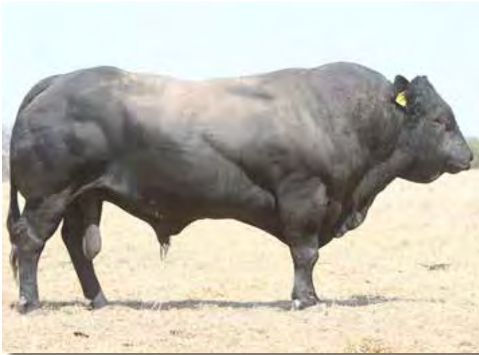
Le Martres Black Drake (D89) - Aust. Pure, Black & Polled