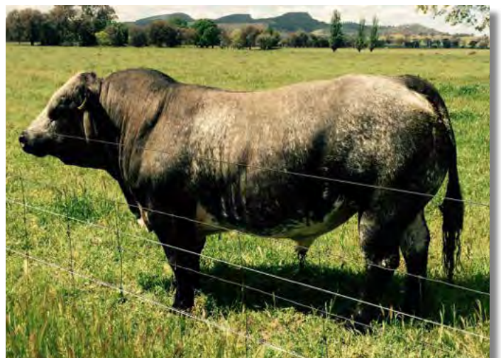
Le Martres Blue Kaleb (K121) - 3/4 Pure & Polled