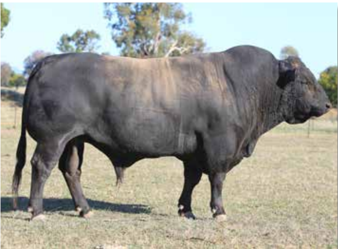
Limoges El Bulli (E16) - Aust. Pure, Black & Polled