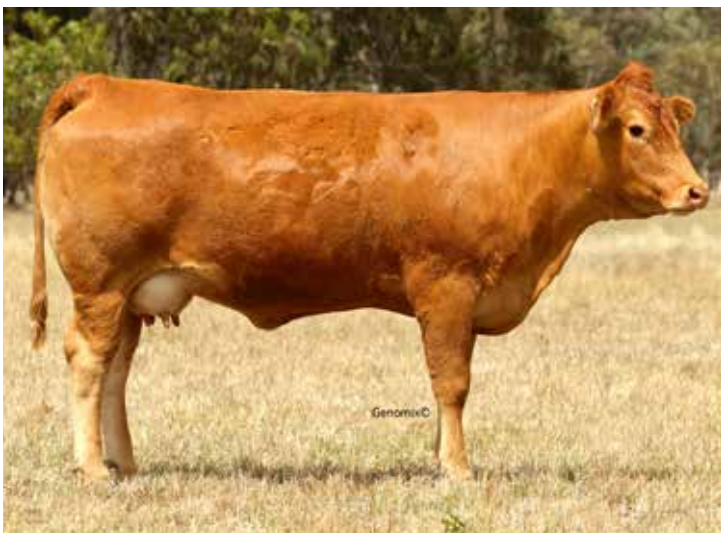
Le Martres Fifi LEMPF57