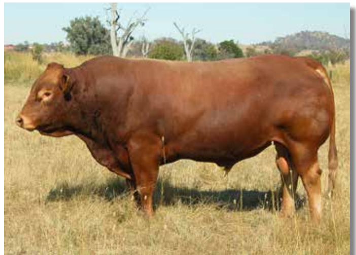
Limoges Esument (E22) - Aust. Pure & Polled