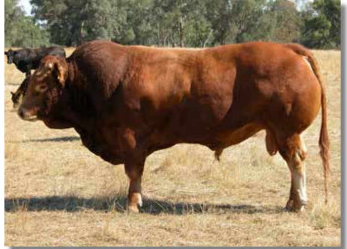
Le Martres Edwin (E42) - Aust. Pure & Polled