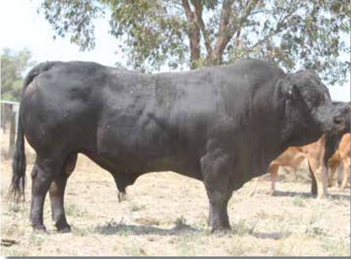
Le Martres Black Edbert (E24) - Aust. Pure, Black & Polled