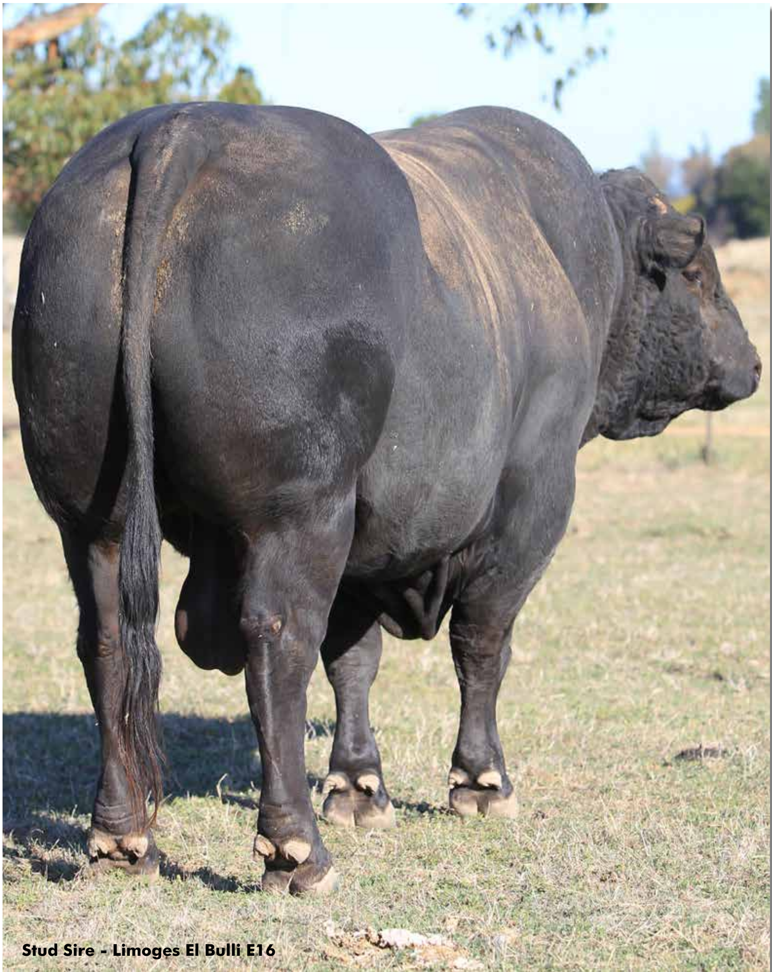
Stud Sire - Limoges El Bulli E16