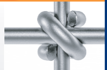
New S-fence Wire!

SAFE - SECURE - SIMPLE Fabricated in Australia Introductory pricing available!