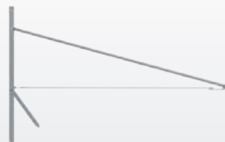
Clipex® End Assemblies