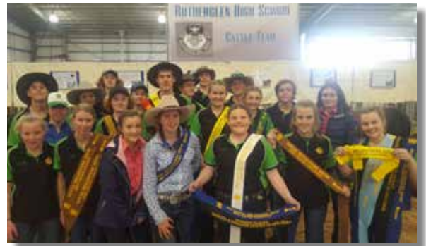
Rutherglen Team and the winning ribbons and smiles.