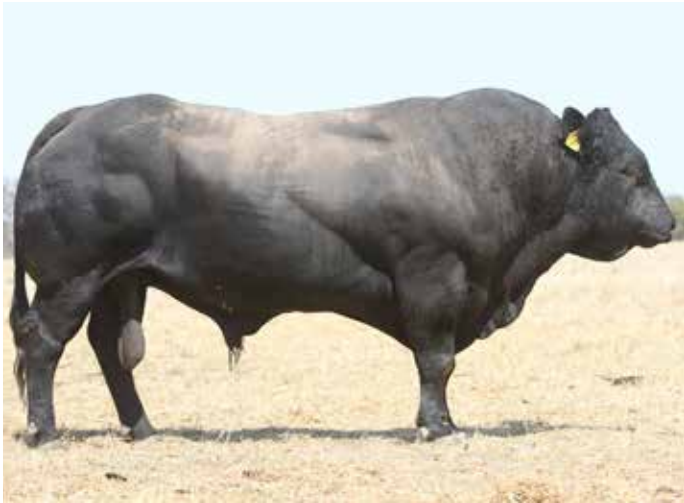
Le Martres Black Drake (D89) - Aust. Pure, Black & Polled