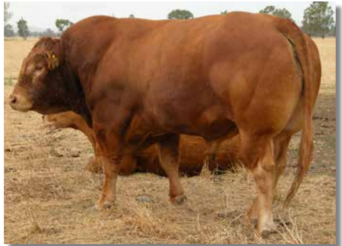
Le Martres Darby (D58) - French Pure