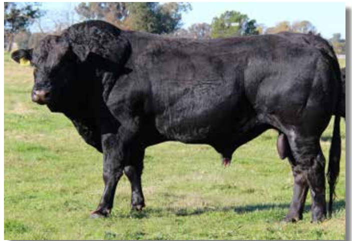
Le Martres Black Declan (D41) - Aust. Pure, Black & Polled