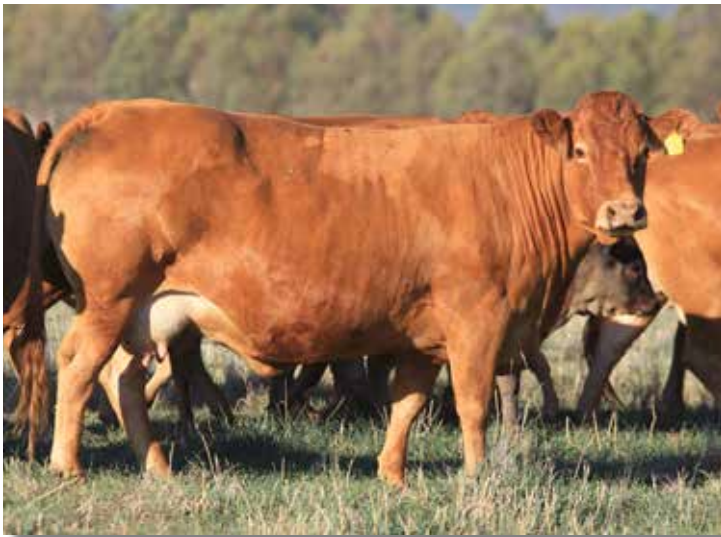
Le Martres Zille LEMFZ43