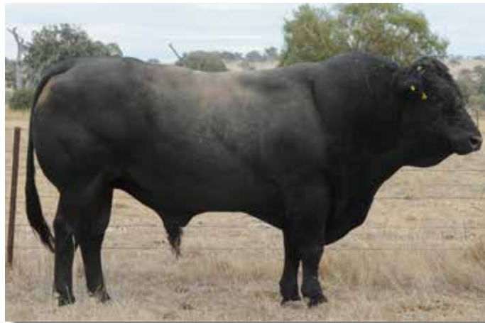
Le Martres Black Herald (H87) - Aust. Pure & Scurred