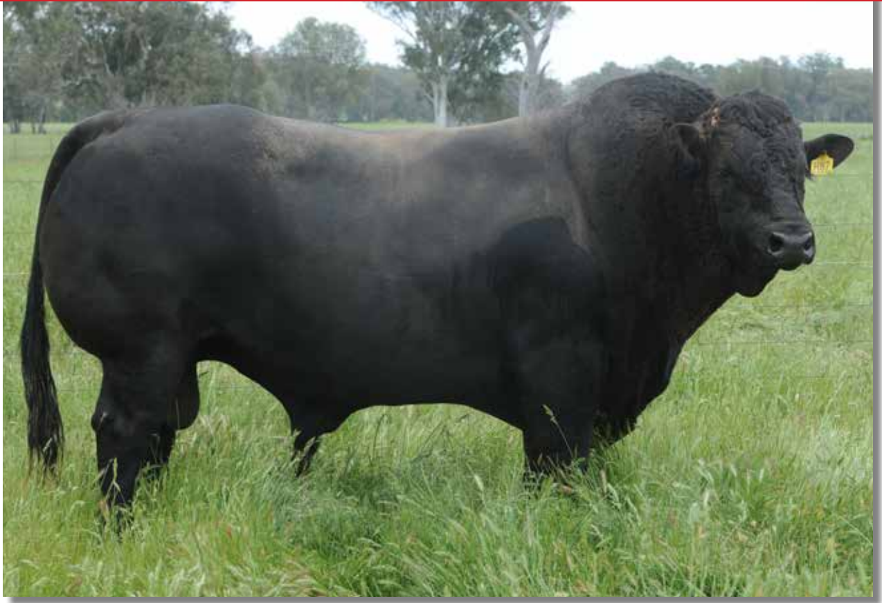
Stud Sire - Le Martres Black Herald H87