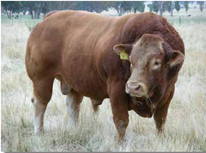
Le Martres Chad (C90) - French Pure