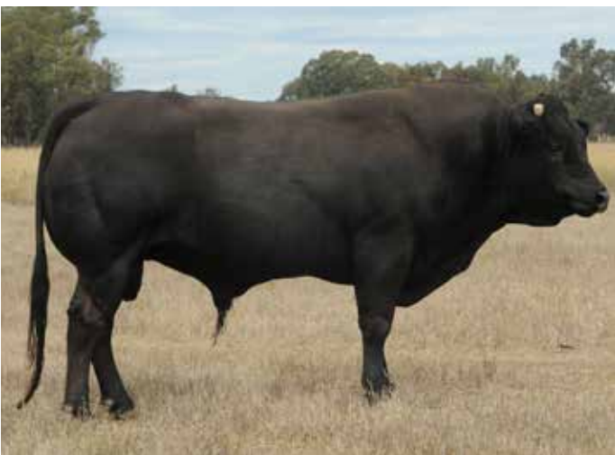
Le Martres Black Jacob (J72) - Aust. Pure & Scurred