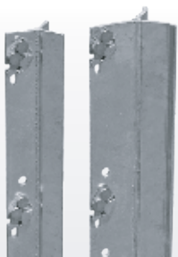
Clipex® Fence Posts

Don't waste time tying wire to fence posts Do it right and clip them in!