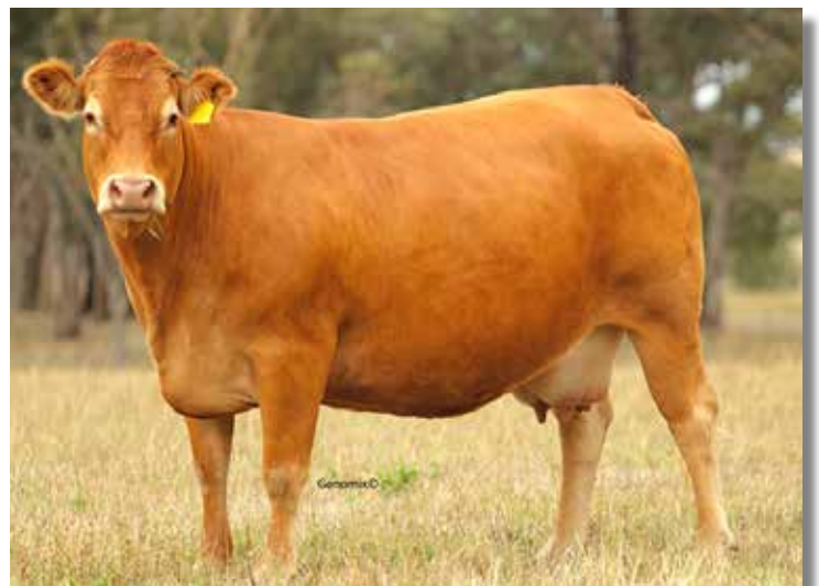
Le Martres Celest LEMPC55