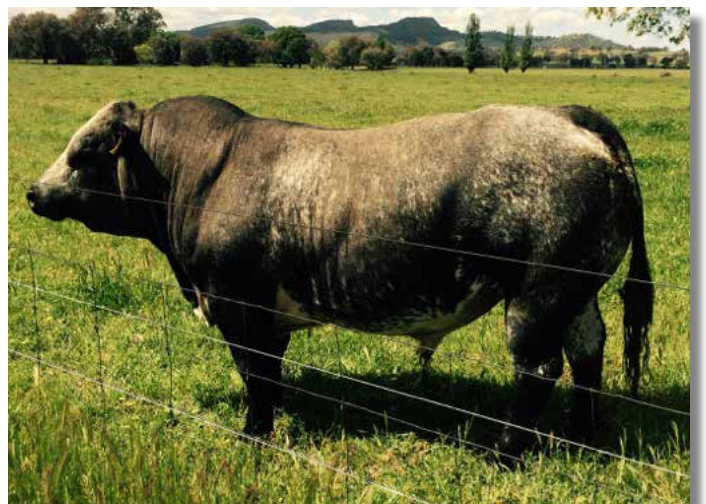
Le Martres Blue Kaleb (K121) - 3/4 Pure & Polled