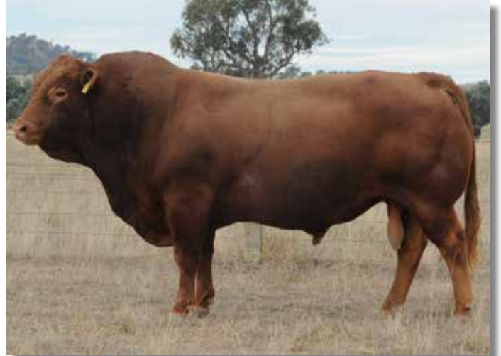
Le Martres Hambleton (H59) - Aust. Pure & Polled