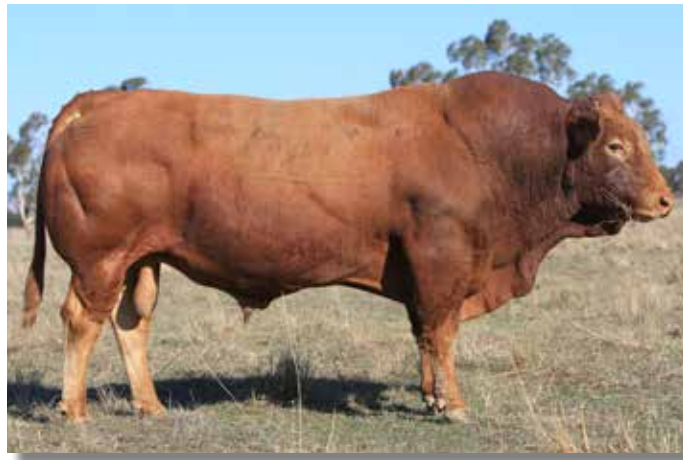
Le Martres Eleazor (E57) - French Pure