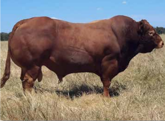
Le Martres Governor (G70) - Aust. Pure & Polled