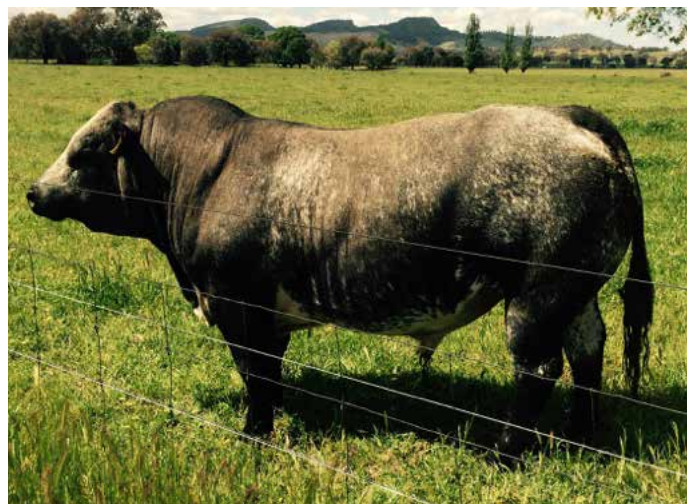
Le Martres Blue Kaleb (K121) - 3/4 Pure & Polled