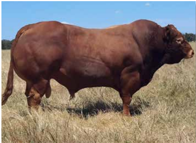
Le Martres Governor (G70) - Aust. Pure & Polled