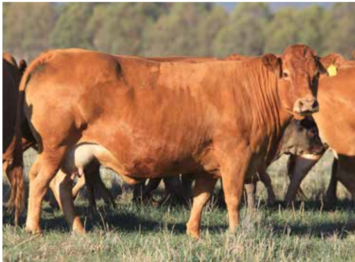
Le Martres Zille LEMFZ43