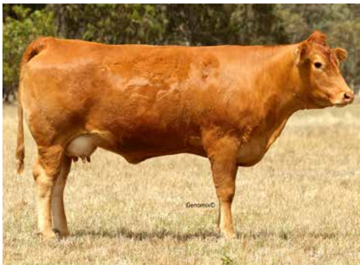
Le Martres Fifi LEMPF57