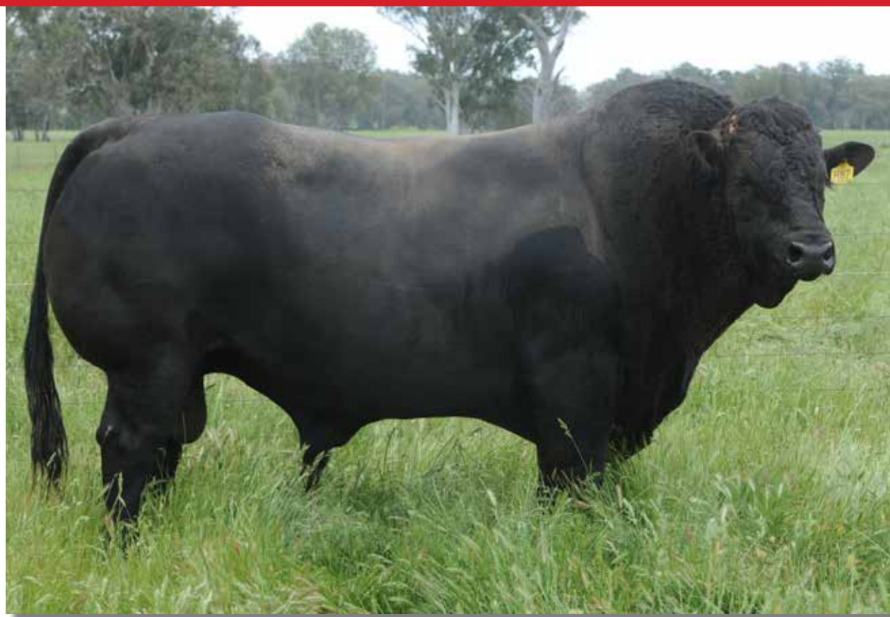
Stud Sire - Le Martres Black Herald (H87)