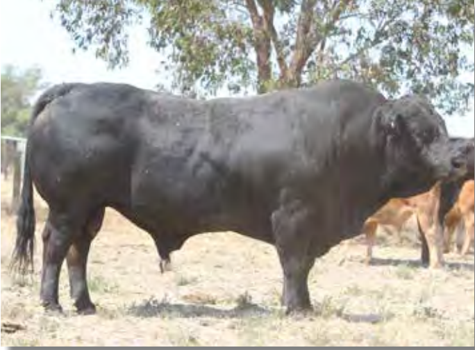
Le Martres Black Edbert (E24) - Aust. Pure, Black & Polled