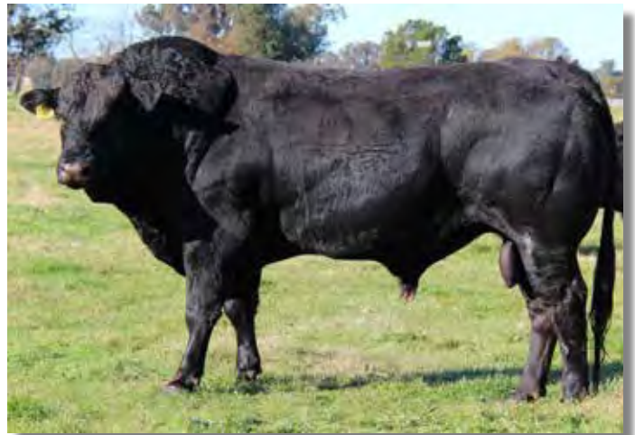
Le Martres Black Declan (D41) - Aust. Pure, Black & Polled