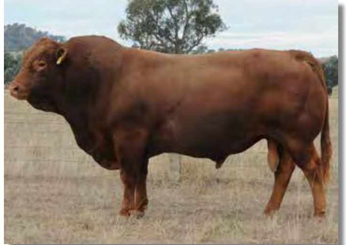
Le Martres Hambleton (H59) - Aust. Pure & Polled