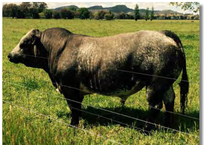
Le Martres Blue Kaleb (K121) - 3/4 Pure & Polled