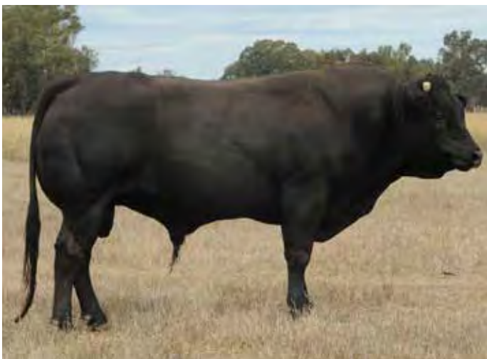
Le Martres Black Jacob (J72) - Aust. Pure & Scurred