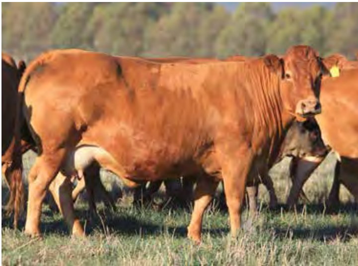
Le Martres Zille LEMFZ43