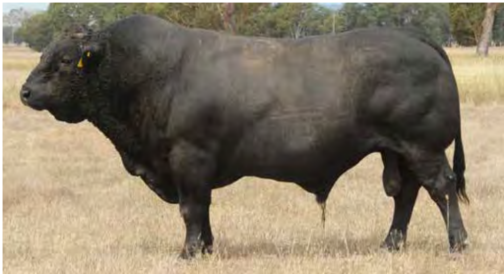
Limoges El Bulli (E16)

Limoges El Bulli (E16) is now a 7 year old sire, with daughters coming into the Le Martres Stud Herd and with many sons already out in local commercial herds. Many folk have met our giant, black bull at the Le Martres Beef stand at the 2015 Henty Machinery Field Days. El Bulli will again be available to meet you at the Le Martres Annual Bull Sale, on property, held at 'Rosemont Farm', Table Top NSW on Feb 24.