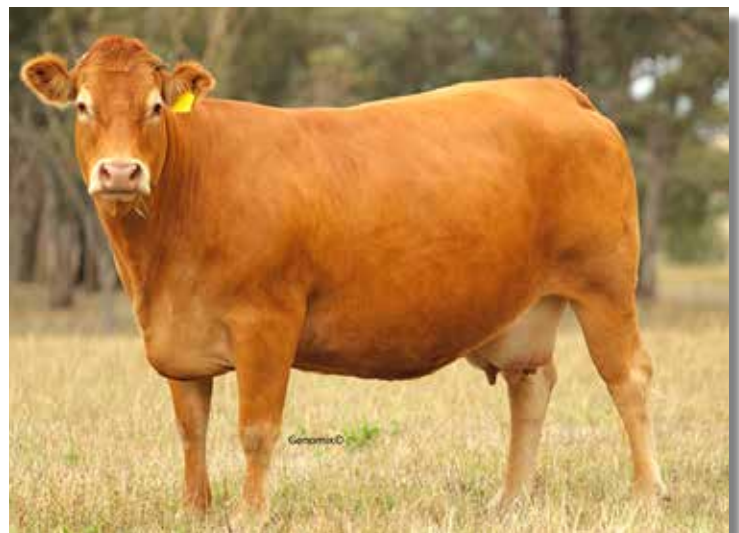
Le Martres Celest LEMPC55