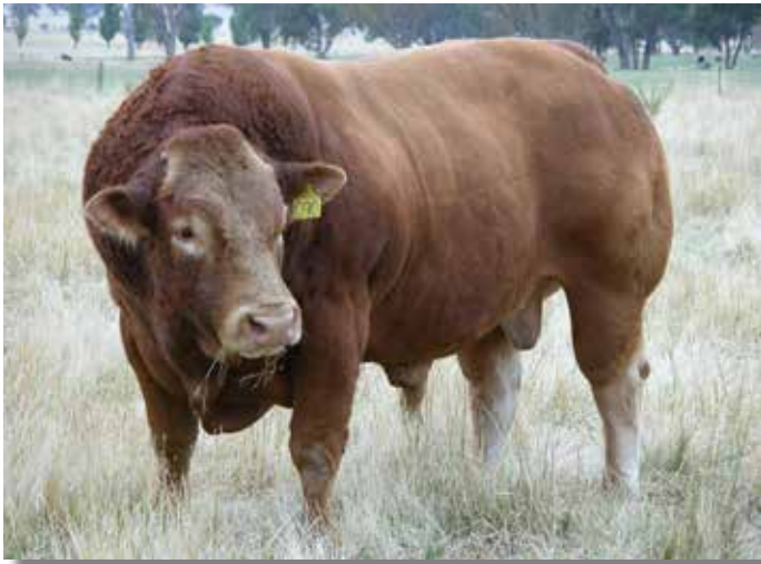
Le Martres Chad (C90) - French Pure