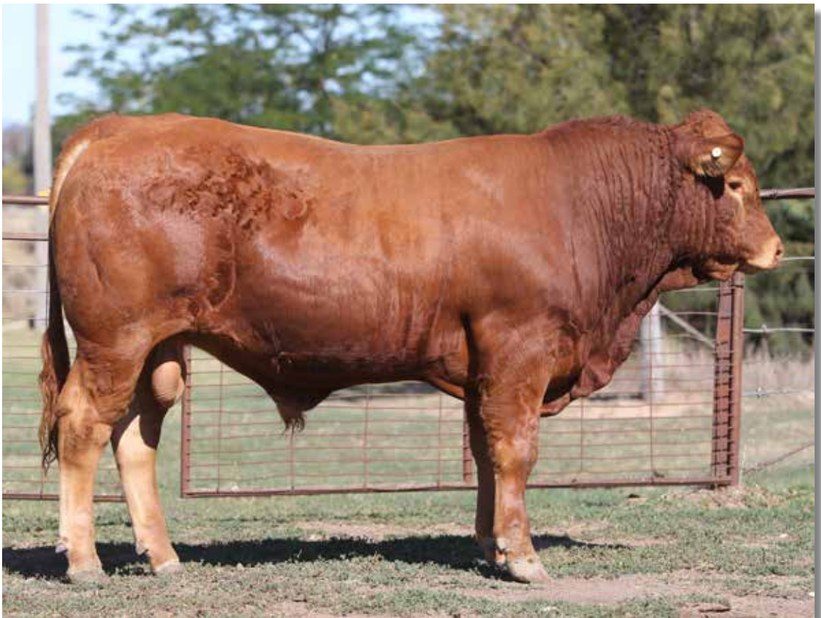
LOT 6 - Le Martres Jonah LEMPJ29