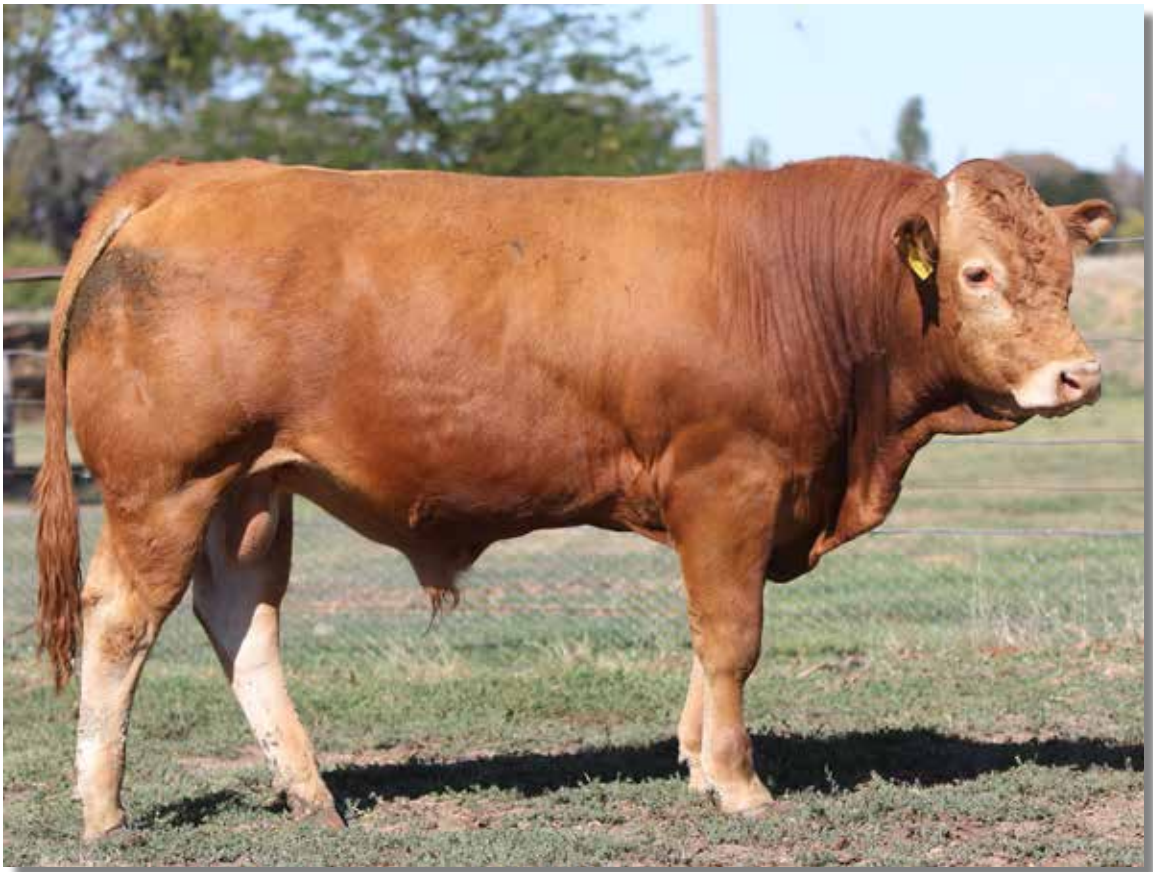
LOT 7 - Le Martres Jevon LEMPJ31