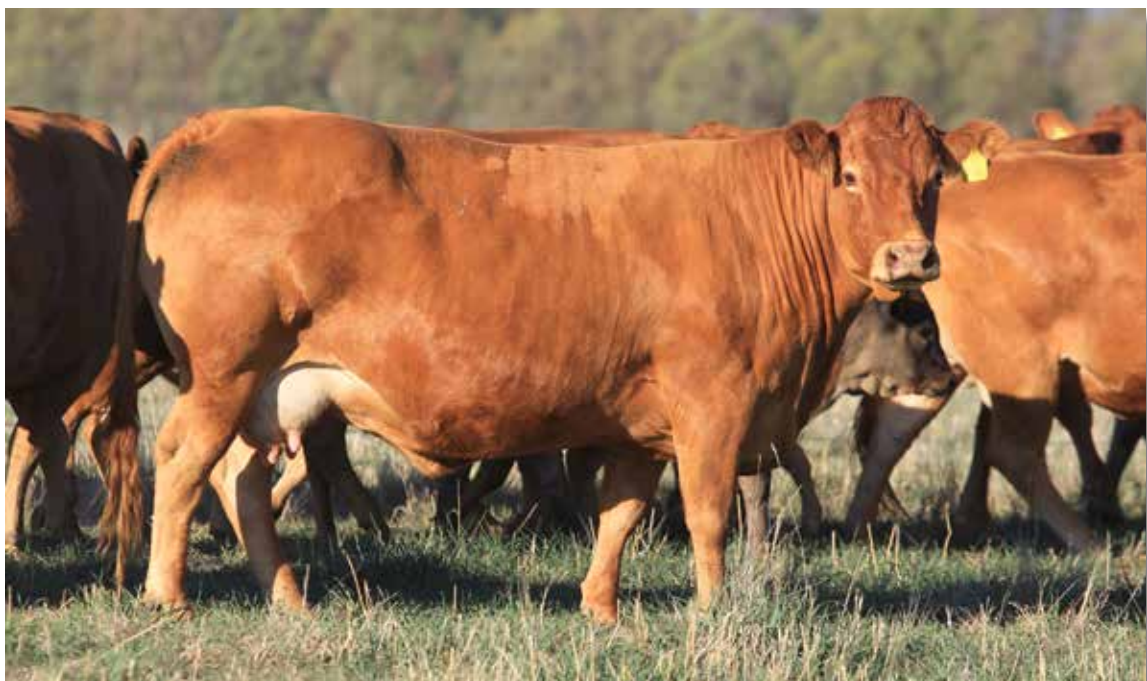
Le Martres Zille LEMFZ43