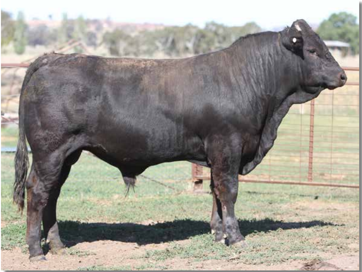
LOT 5 - Le Martres Black Jerome LEMPJ99