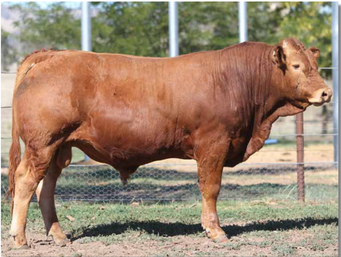
LOT 10 - Le Martres Johannes LEMFJ78